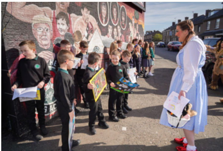
Children from the four local primary schools displaying their winning art pictures in the Road Safety poster competition.