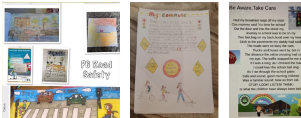
Some of the posters from the Arts competition held in local primary schools

An art poster competition was held to encourage children to participate. The leaflet advertising the competition was circulated to four primary schools in the area and posters, poems and videos were received from three primary schools promoting messages on road safety. In total 28 winning posters from the three schools were awarded with a voucher.