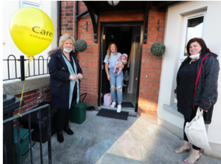
Inspiring hope with residents during the Covid 19 pandemic