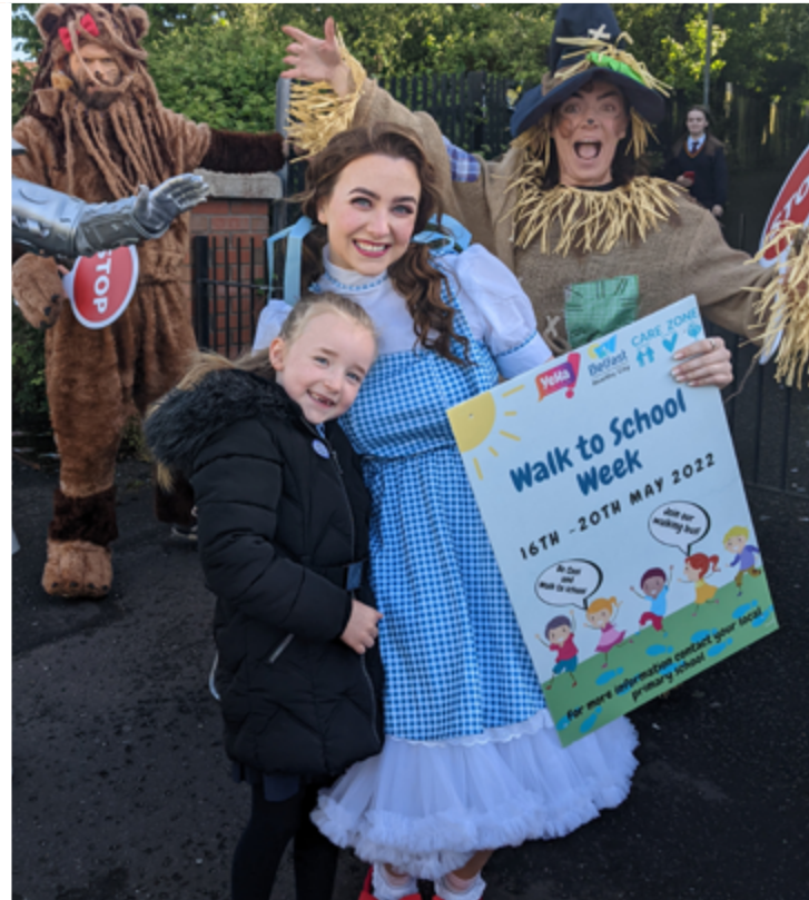
Walk to School week: Our Lady's Girls' PS, Sacred Heart Boys' PS and Ballysillan PS with Wizard of Oz characters, leading the way with their Walking Buses